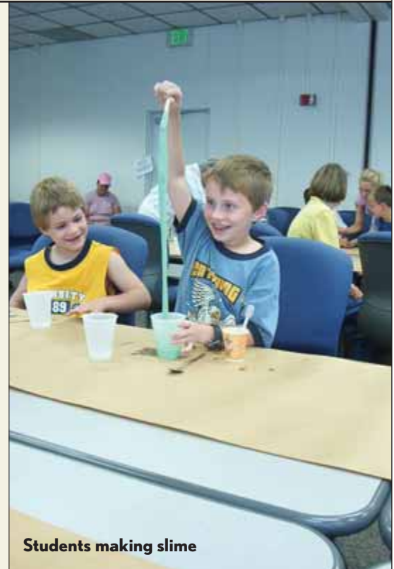
Students making slime

Feedback from kids and parents continues to be very positive. Many kids comment that they don't like science in school, with lots of worksheets, but they love the hands-on activities at Science Saturdays. They frequently pester the volunteers for information on how to do the activities and related ones at home. Parents enjoy that the volunteers present very advanced concepts, concepts most kids won't see until high school or beyond, respecting the intelligence and curiosity of their children. The experience sticks with the kids, sometimes literally. One parent reported that her daughter was still playing with the slime two months later!