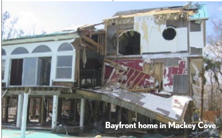
Bayfront home in Mackey Cove

Considering the tremendous task involved, we at IHMC and throughout the community are recovering at an extremely rapid pace. Most of the speed is due to the hard work of many people, all chipping in to help where they can. Though many services are up and running, it will be several month before a sense of normalcy returns for most people and longer for many others.