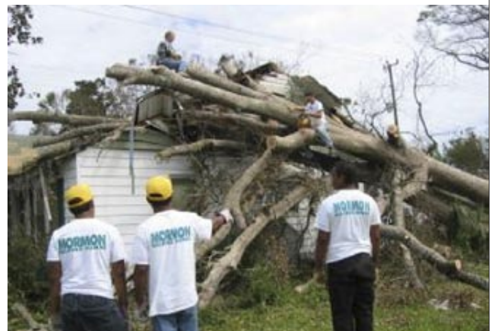
Volunteers coordinated by IHMC's Bradshaw